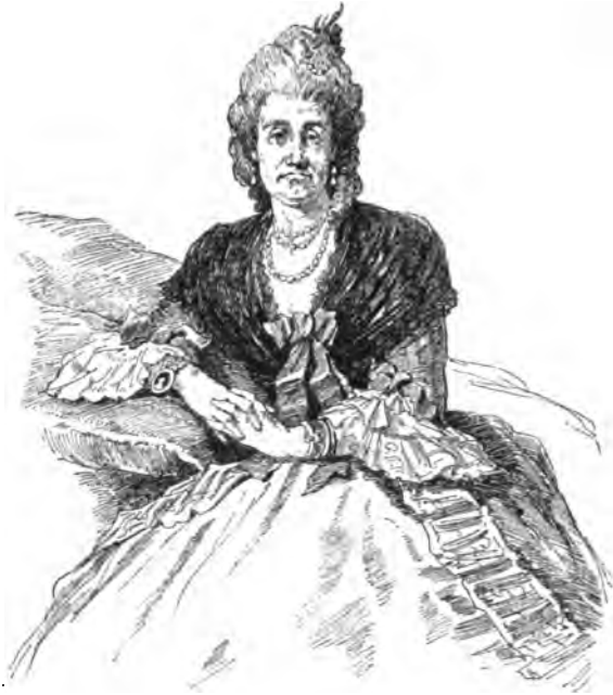
'The Widow Scraggs.'

not unfrequently lecturing young men gratis. Now Sir Ulick O'Shane was a sinner, how then could he please a saint? He did, however—but the saint did not please him—though she set to work for the good of his soul, and in her own person relaxed, to please his taste, even to the wearing of rouge and pearl-powder, and false hair, and false eyebrows, and all the